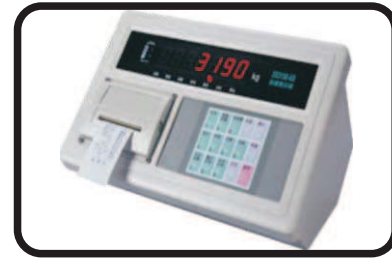
Built-in Printer Indicator