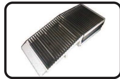
A Type Platform Rollers & Ramps