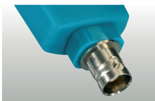
testo 206-pH3: pH3 probe head with BNC interface