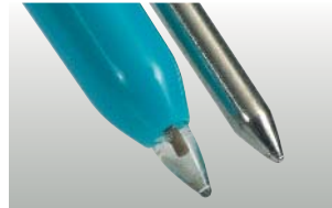
testo 206-pH2: pH2 probe head for semi-solid food

Ideal for the testing and care of water-based coolant-lubricants (according to BGR 143).